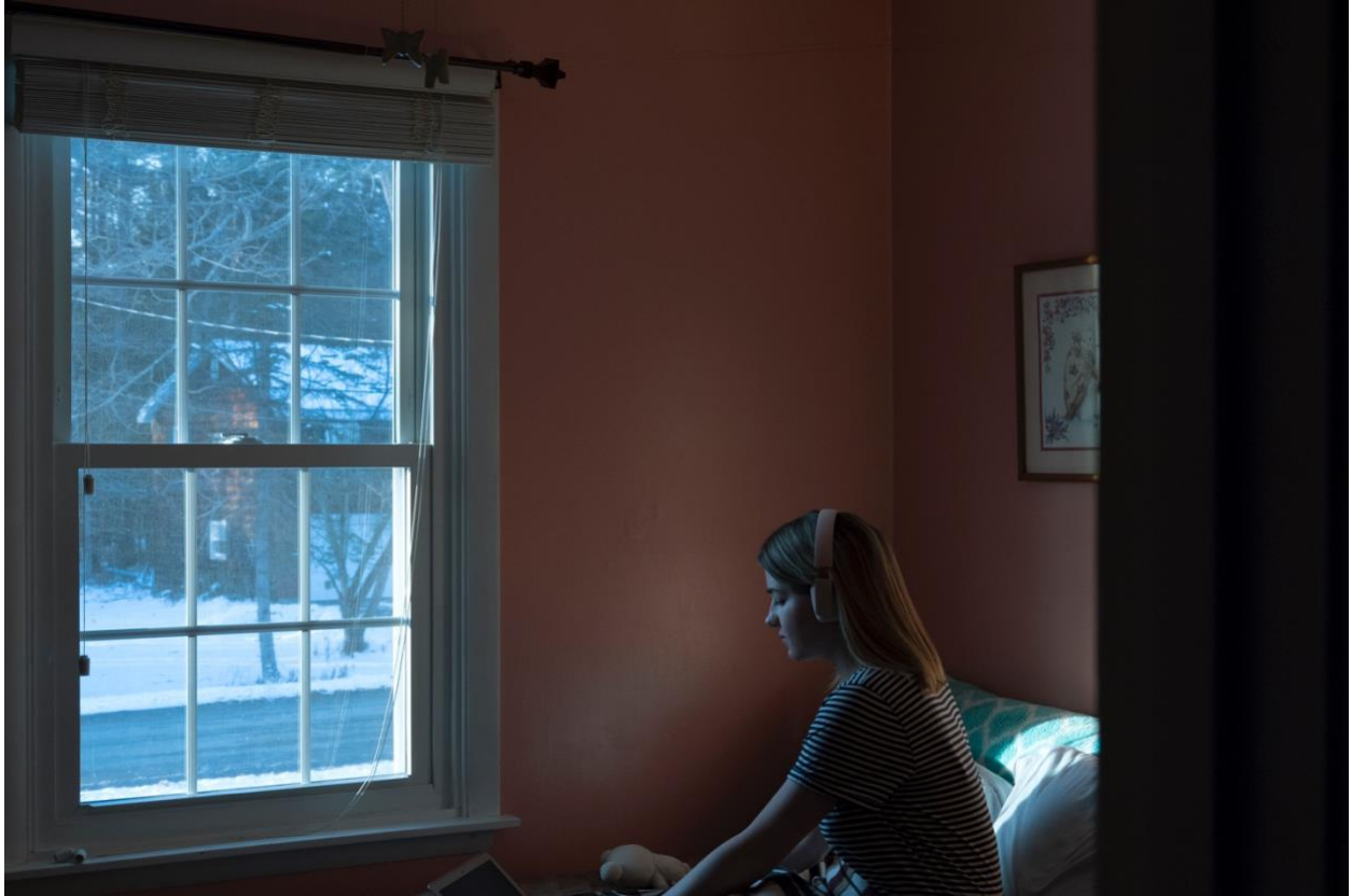
Student 1 Sample 2_Introduction to Digital Photography Fall 2018