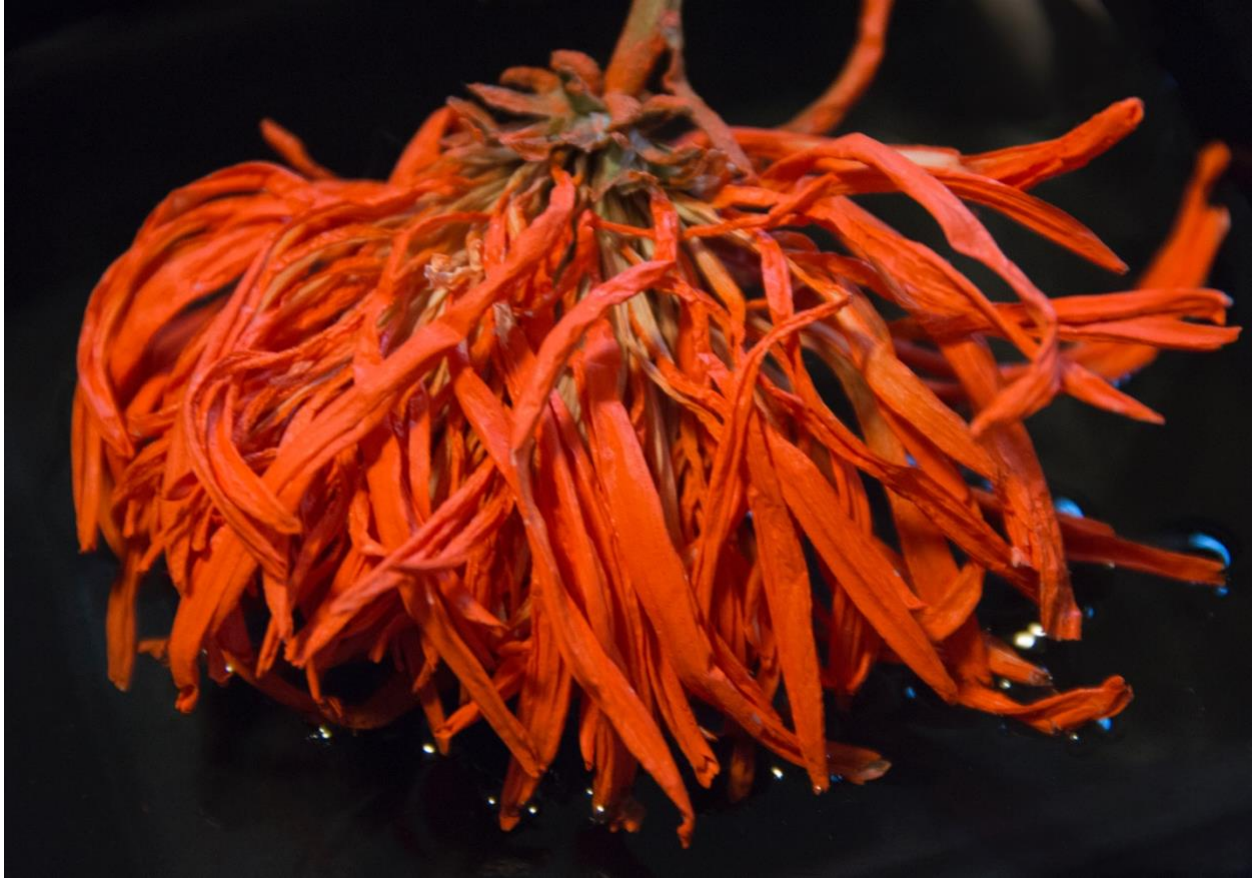
Student 2 Sample 3_Introduction to Digital Photography Fall 2018