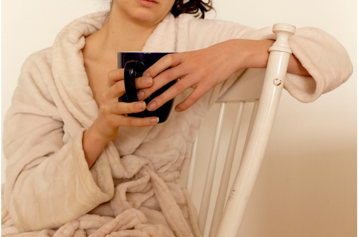
Student 6 Sample 2_Introduction to Digital Photography Fall 2018