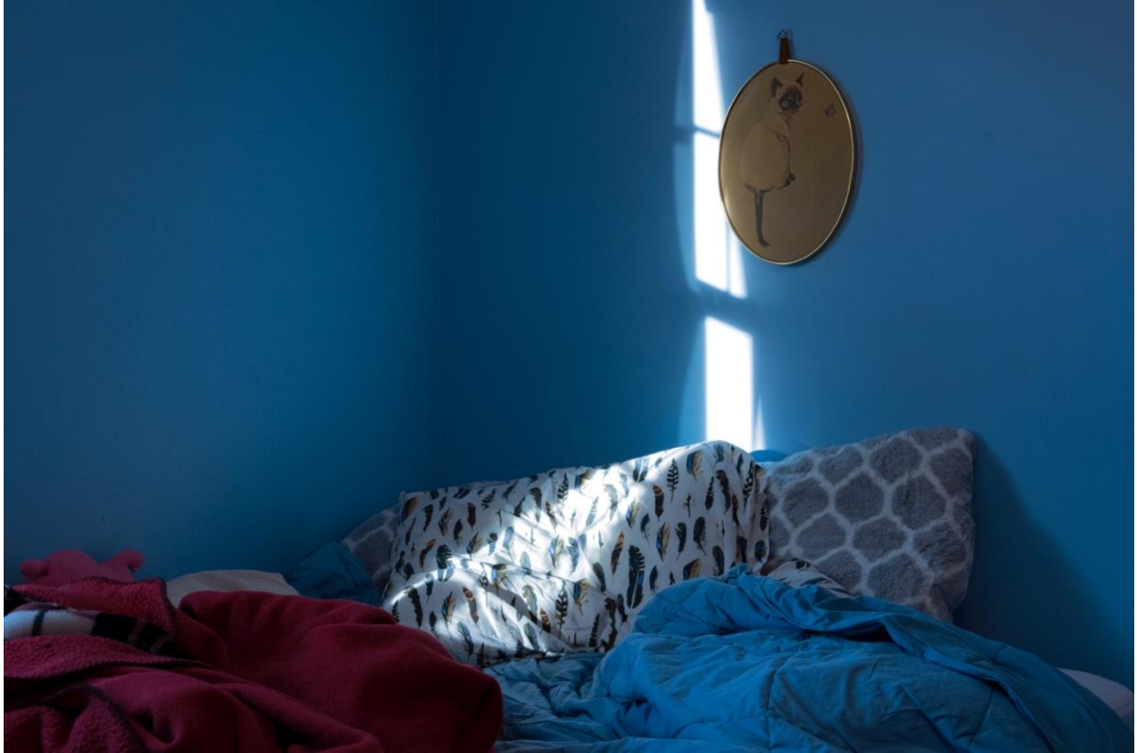
Student 1 Sample 3_Introduction to Digital Photography Fall 2018