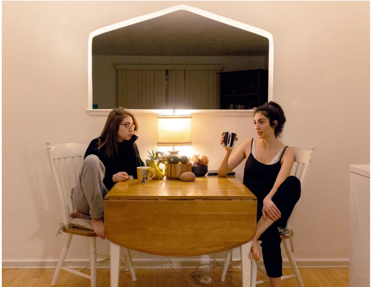
Student 6 Sample 1_Introduction to Digital Photography Fall 2018