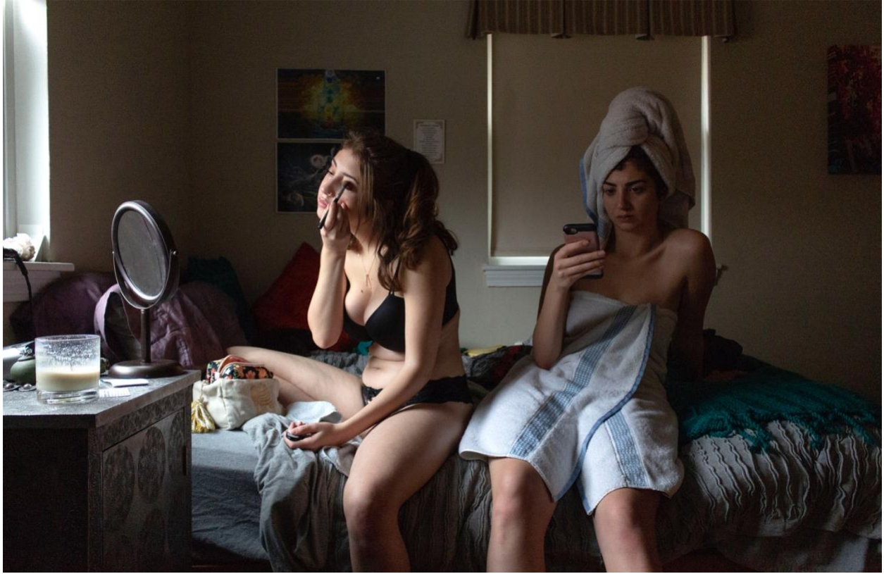
Student 6 Sample 3_Introduction to Digital Photography Fall 2018