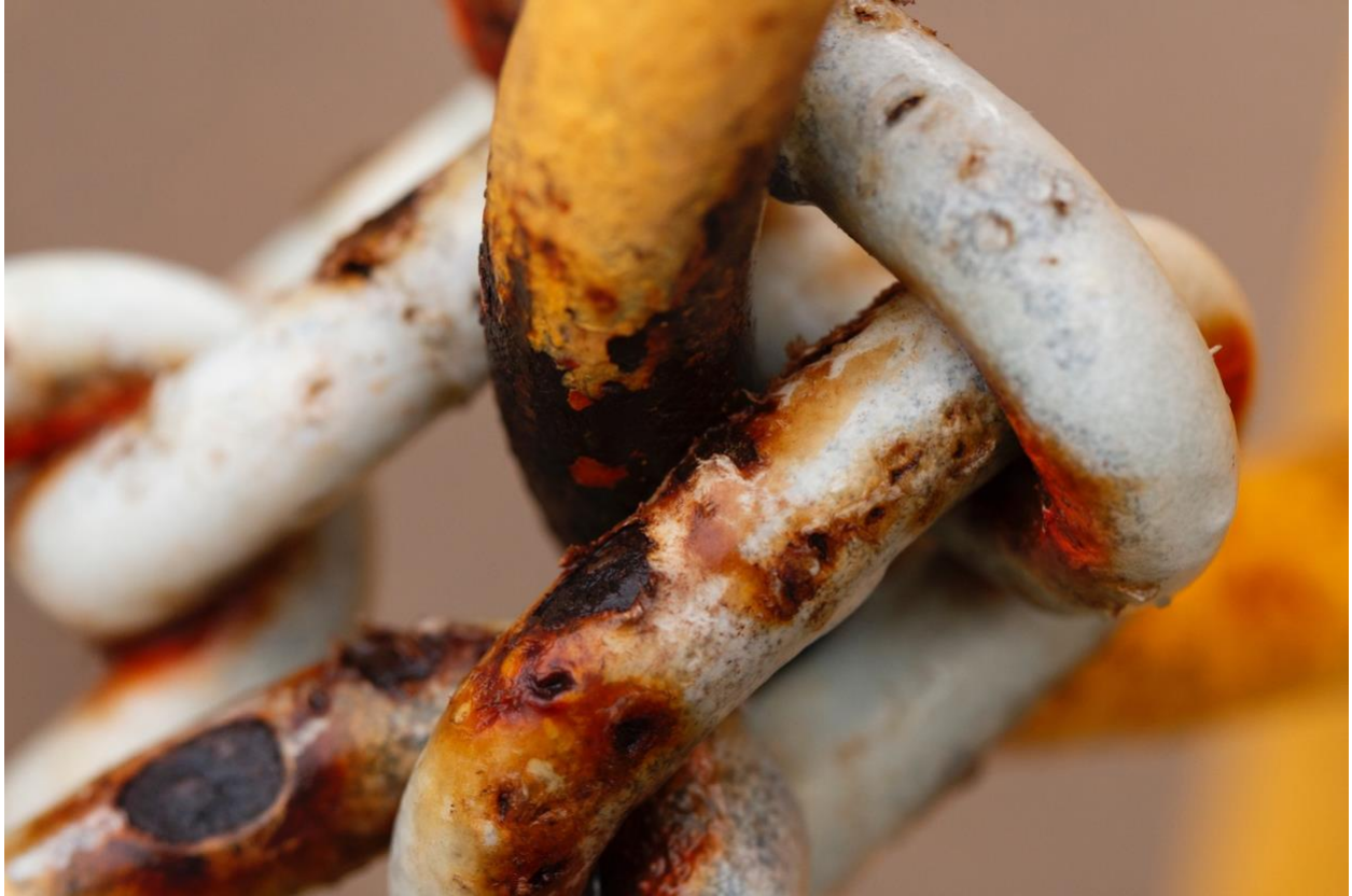
Student 2 Sample 2_Introduction to Digital Photography Fall 2018