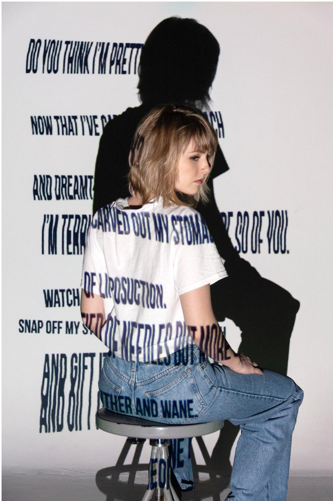
Student 3 Sample 1_Introduction to Digital Photography Fall 2018