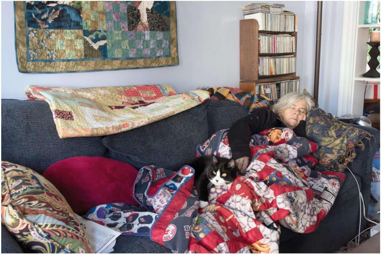
Student 5 Sample 2_Introduction to Digital Photography Fall 2018