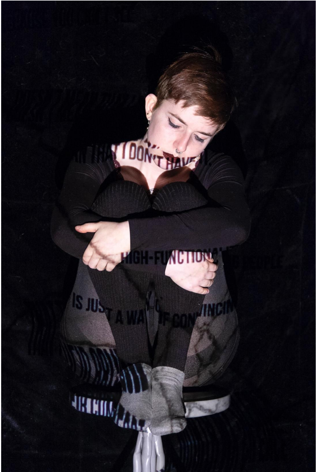
Student 3 Sample 2_Introduction to Digital Photography Fall 2018