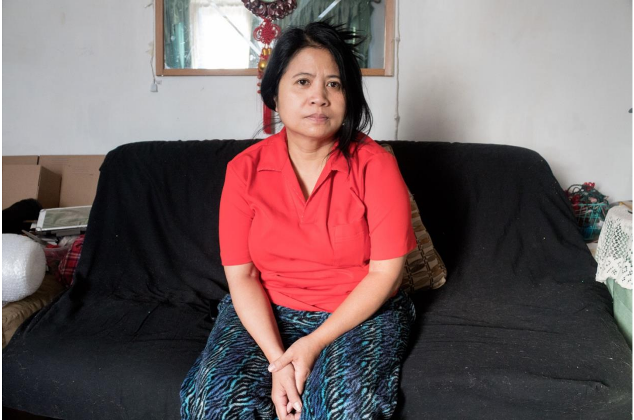
Student 7 Sample 3_Introduction to Digital Photography Fall 2018