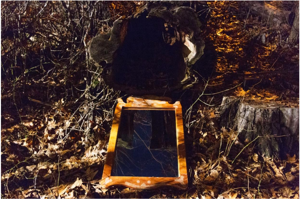
Student 4 Sample 2_Introduction to Digital Photography Fall 2018