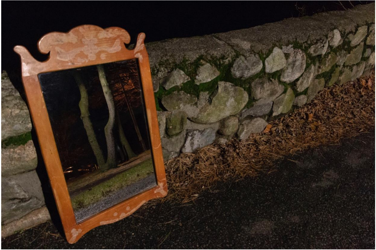
Student 4 Sample 1_Introduction to Digital Photography Fall 2018