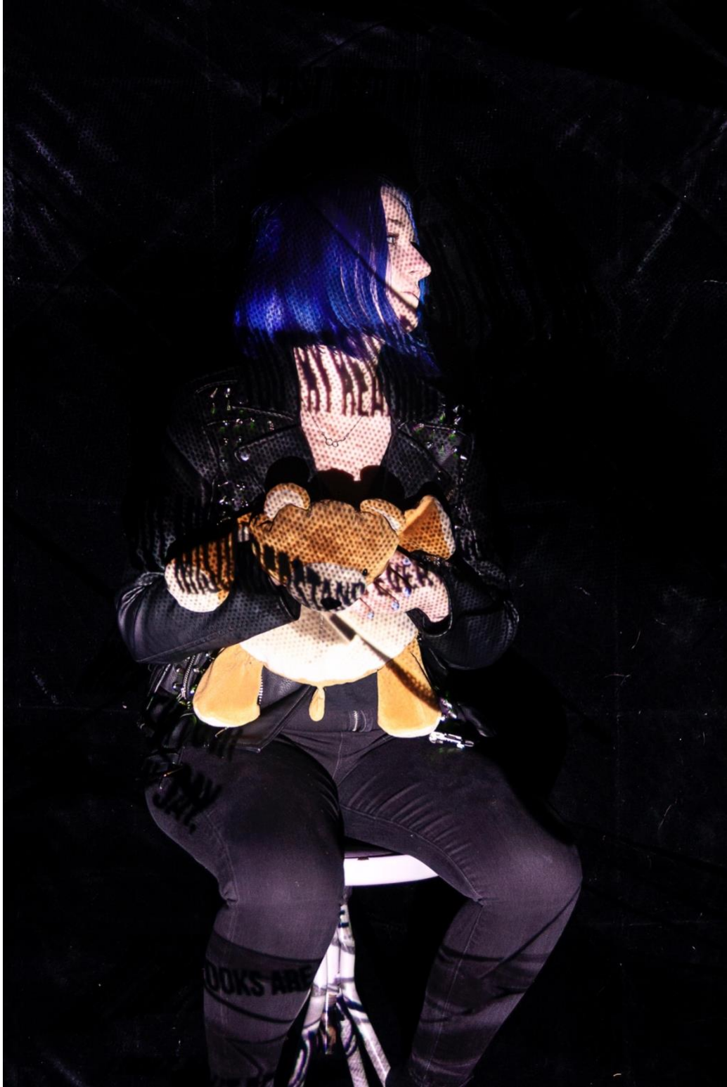
Student 3 Sample 3_Introduction to Digital Photography Fall 2018