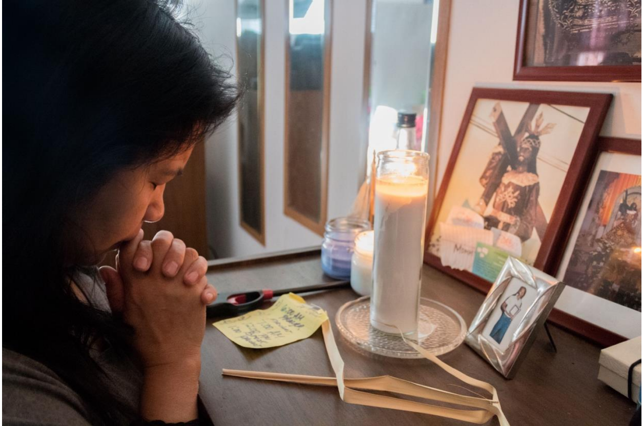
Student 7 Sample 2_Introduction to Digital Photography Fall 2018