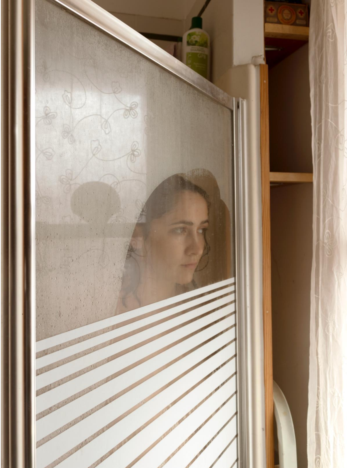
Student 5 Sample 1_Introduction to Digital Photography Fall 2018