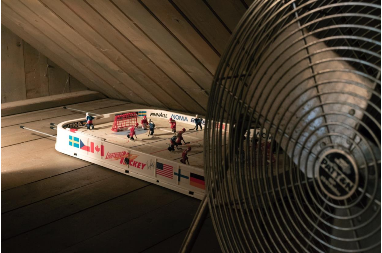
Student 5 Sample 3_Introduction to Digital Photography Fall 2018