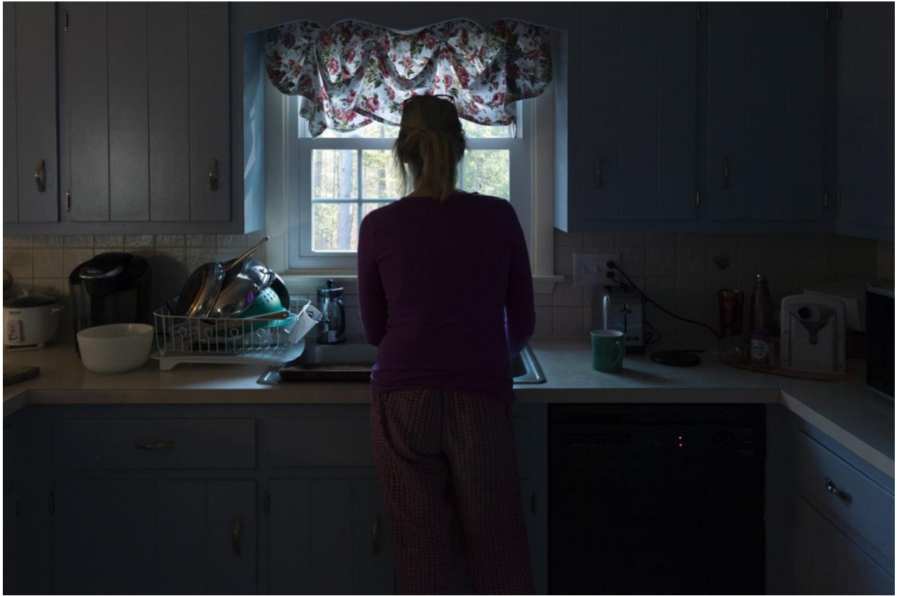
Student 1 Sample 1_Introduction to Digital Photography Fall 2018