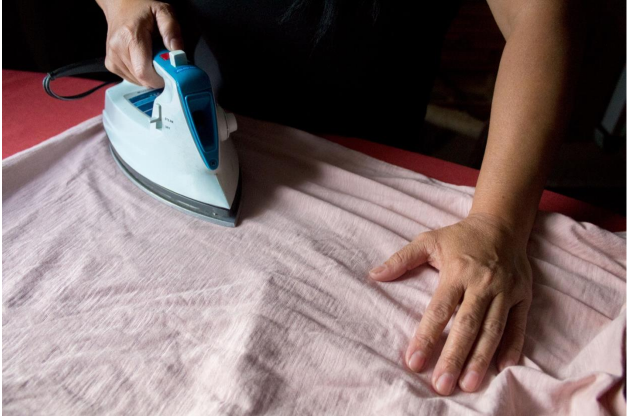
Student 7 Sample 1_Introduction to Digital Photography Fall 2018