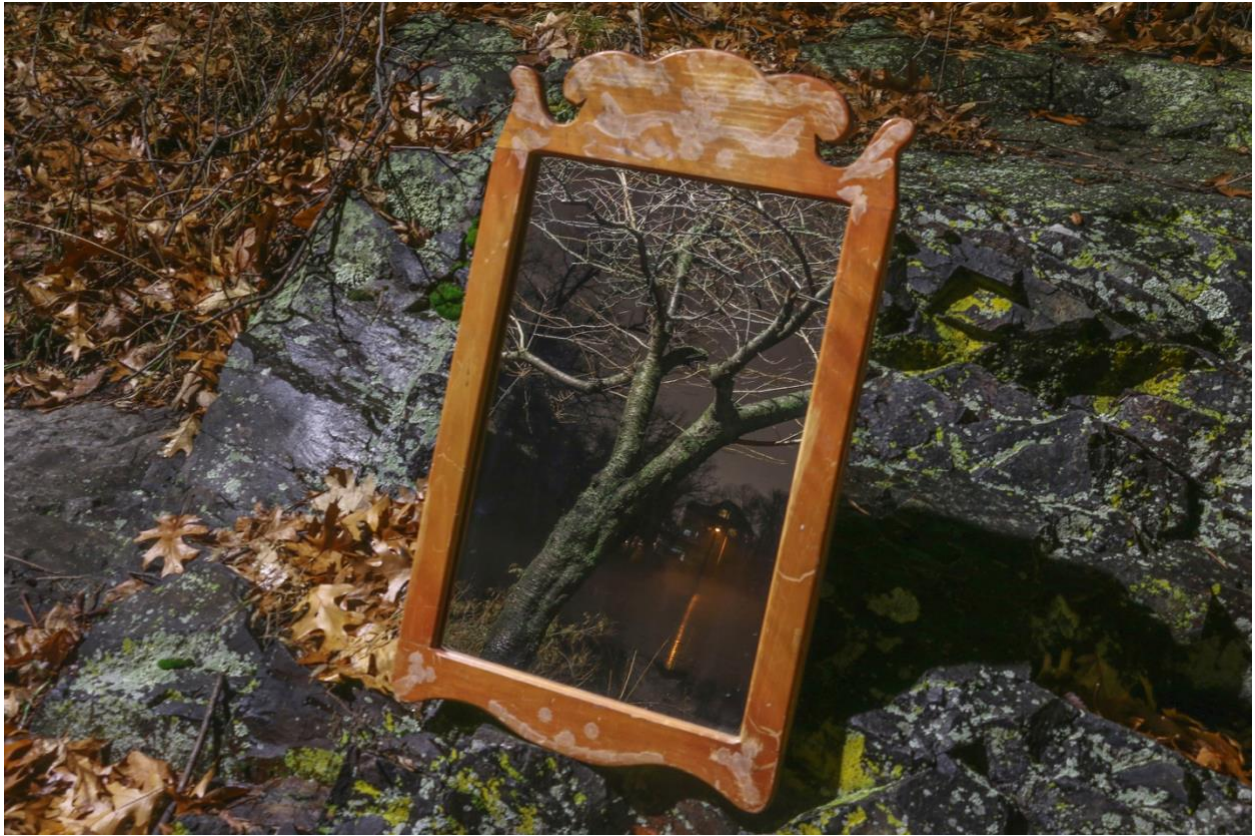
Student 4 Sample 3_Introduction to Digital Photography Fall 2018